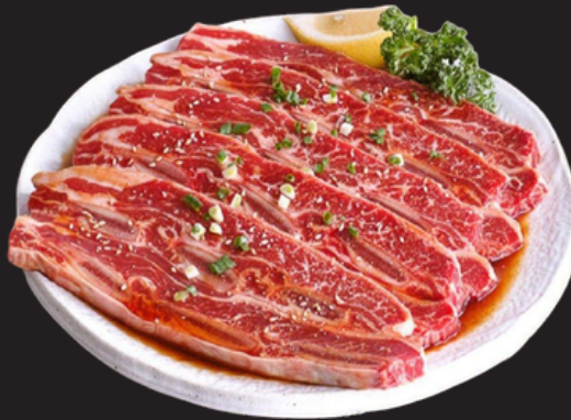
Premium Marinated LA Galbi