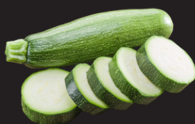
Zucchini (upon request)