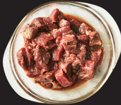
Marinated Beef Tenderloin

Select two pork choices below to include with the set: