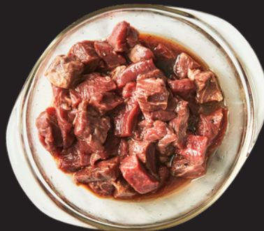
Marinated Beef Tenderloin