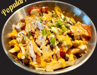
Kimchi Fries w/ Ribeye Beef Bulgogi