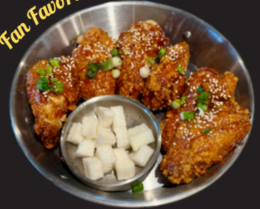
Homemade Korean Fried Chicken Wings