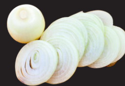
King Oyster Mushroom, Zucchini, & White Onions for One (upon request)

Please notify your server if you have any dietary needs. Consuming raw or undercooked meats, poultry, seafood, shellfish, or eggs may increase your risk of food-borne illness. Once food has been cooked at your table, it may not be returned and will be charged accordingly. Please share any concerns with your server as soon as possible and before cooking begins. Enjoy!