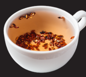
Korean Brown Rice Green Tea