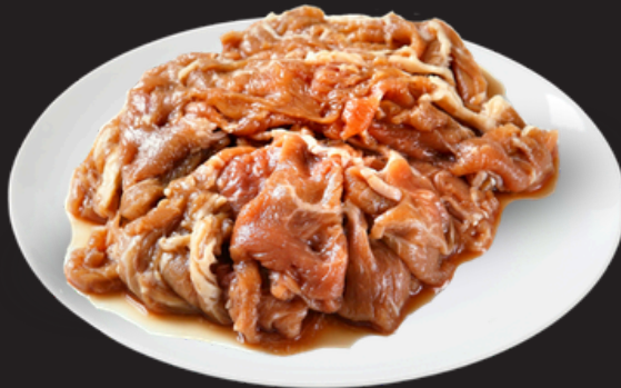
Ribeye Beef Bulgogi