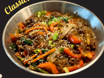
Japchae w/ Ribeye Beef Bulgogi