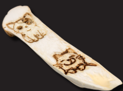
King Oyster Mushroom (upon request)