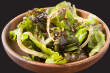
Korean Side Salad