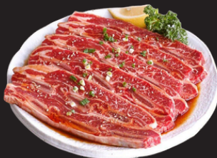
Premium Marinated LA Galbi

American Wagyu Boneless Short Rib (GF) +12.00