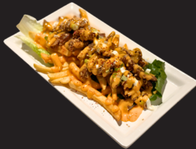
Loaded Fries w/ Crispy Pork Strips