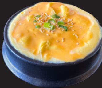
Korean Steamed Egg w/ Cheese