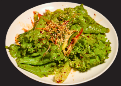
Korean Side Salad