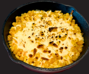
Korean Corn Cheese