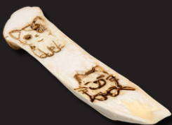
King Oyster Mushroom (upon request)