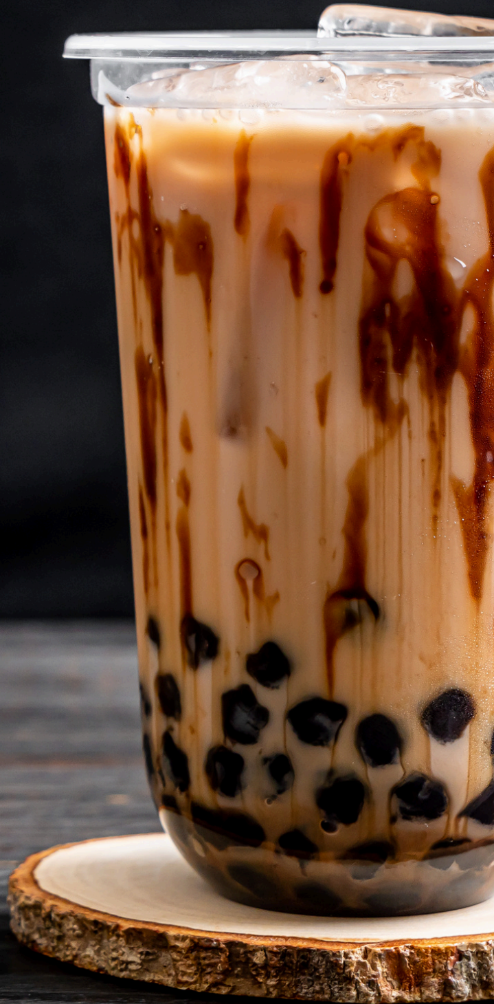
Brown Sugar Milk Tea w/ Tapioca Boba