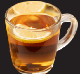
Honey Lemon Tea