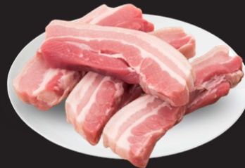
Thick-Cut Pork Belly Gluten-free