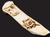
King Oyster Mushroom