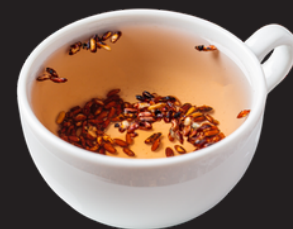
Korean Brown Rice Green Tea

Hot tea, toasty, nutty, served w/ honey | 3.00 Caffeine-free