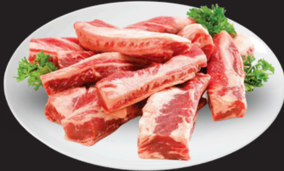
Marinated Rib Finger Meat

Select two pork choices below to include with the set: