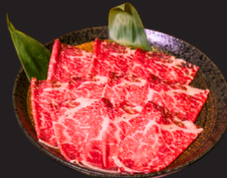
American Wagyu Boneless Short Rib