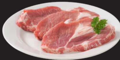
Marinated Pork Steak