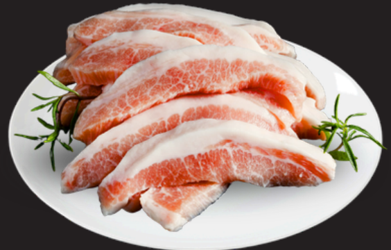
Pork Jowl Gluten-free