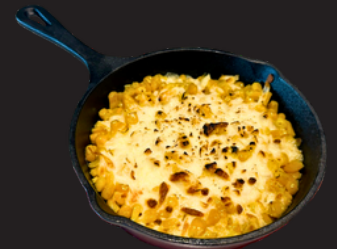
Korean Corn Cheese Gluten-free