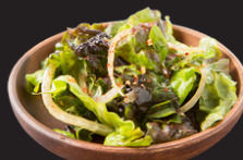
Korean Side Salad