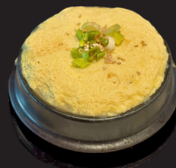
Korean Steamed Egg

Dairy-free, Gluten-free Add Cheese +2.00