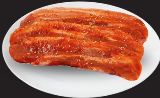
Spicy Pork Belly