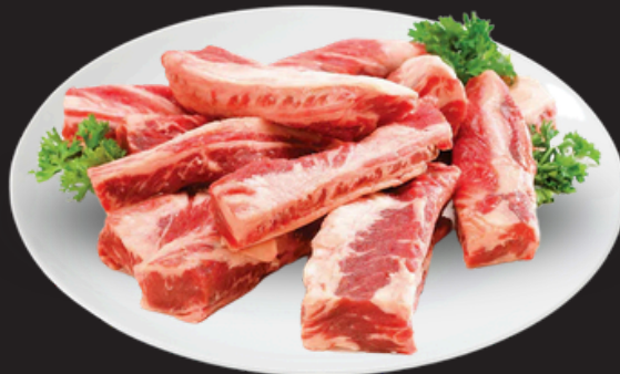
Marinated Rib Finger Meat