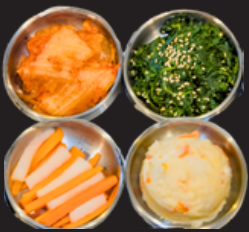
Seasonal Banchan (Korean Side Dishes)