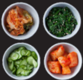
Seasonal Banchan (Korean Side Dishes)