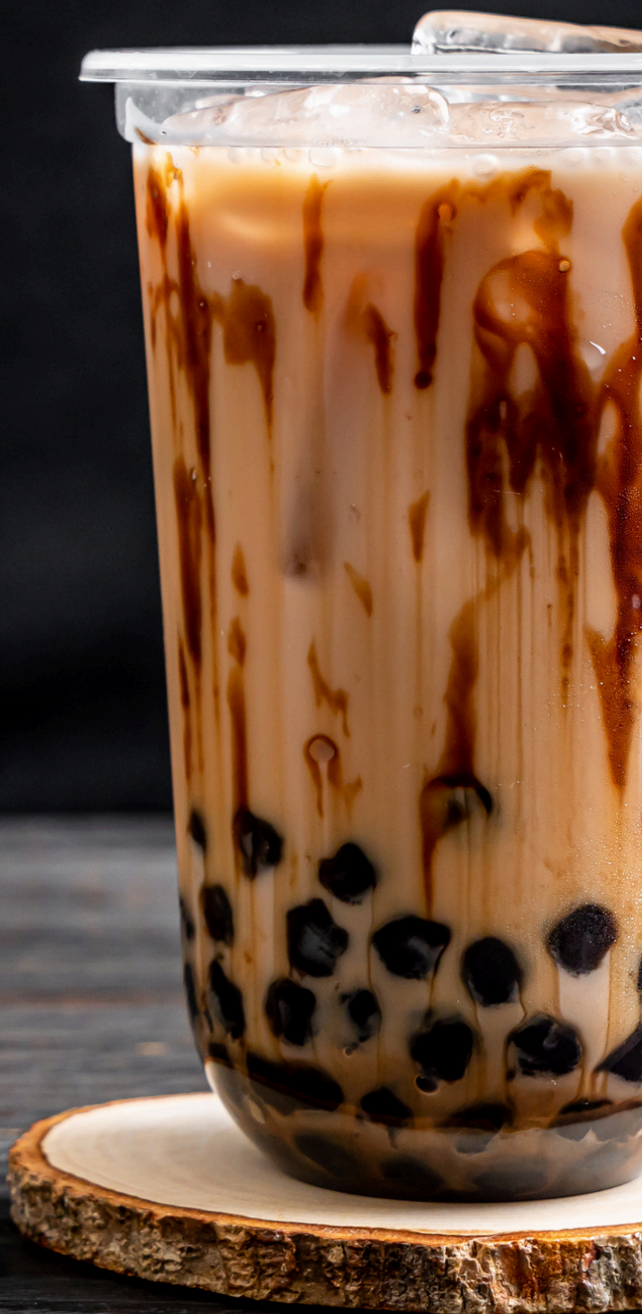
Brown Sugar Milk Tea w/ Tapioca Boba