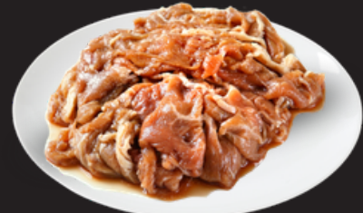
Ribeye Beef Bulgogi