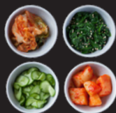
Seasonal Banchan (Korean Side Dishes)