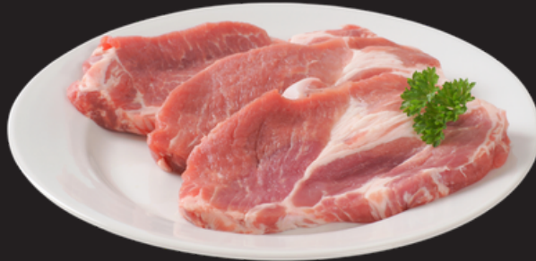
Marinated Pork Collar Steak