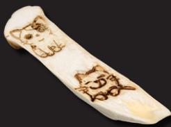
King Oyster Mushroom