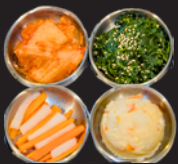
Seasonal Banchan (Korean Side Dishes)