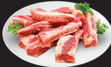
Marinated Rib Finger Meat