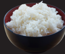
One Bowl of Steamed Rice (available upon request)