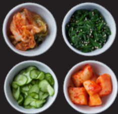
Seasonal Banchan (Korean Side Dishes)