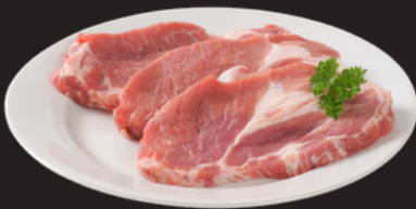
Marinated Pork Collar Steak

Select two pork choices below to include with the set: