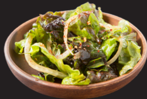
Korean Side Salad for One