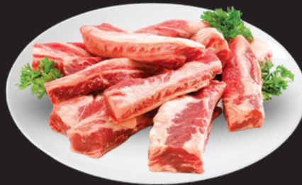
Marinated Rib Finger Meat