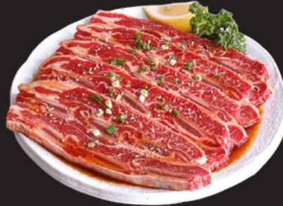
Premium Marinated LA Galbi