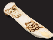
King Oyster Mushroom