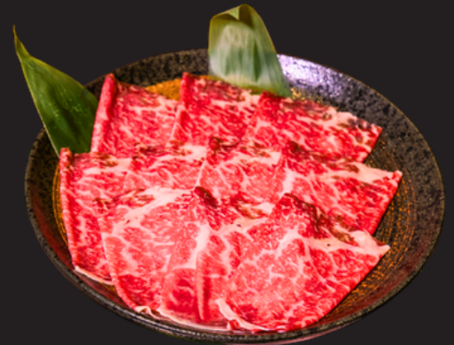
American Wagyu Boneless Short Rib Gluten-free