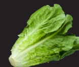
Lettuce Wraps (available upon request)