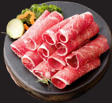
Thin Sliced Beef Brisket Gluten-free