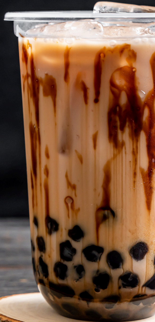
Brown Sugar Milk Tea w/ Tapioca Boba