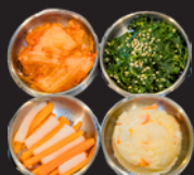
Seasonal Banchan (Korean Side Dishes)