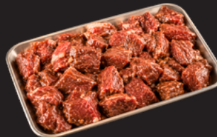
Marinated Beef Tenderloin