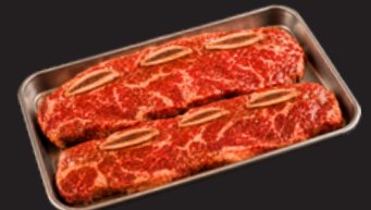
Premium Marinated LA Galbi