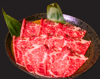
American Wagyu Boneless Short Rib