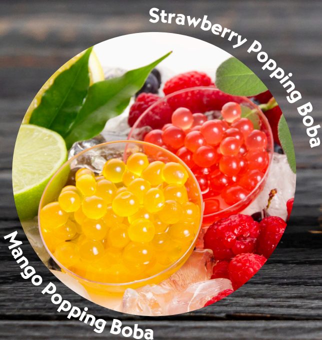
Mango Popping Boba