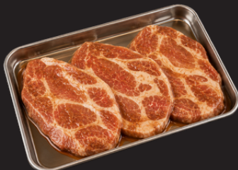
Marinated Pork Collar Steak