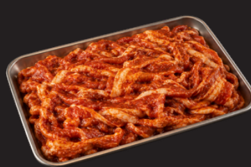
Spicy Pork Belly