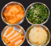
Seasonal Banchan (Korean Side Dishes)