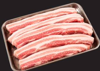
Thick-Cut Pork Belly Gluten-free