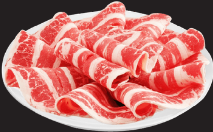
Premium Thin Sliced Beef Short Plate Gluten-free