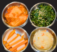
Seasonal Banchan (Korean Side Dishes)