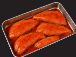
Spicy Chicken Bulgogi