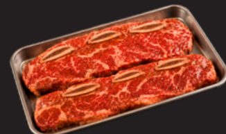
Premium Marinated LA Galbi