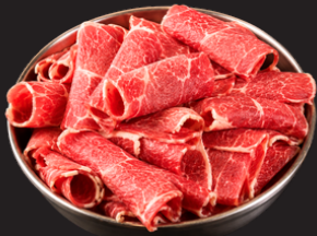
Thin Sliced Beef Brisket Gluten-free

Pick 2 Meats for 26.00 | Pick 3 Meats for 36.00