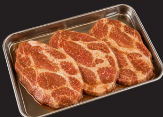
Marinated Pork Collar Steak