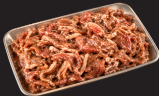
Ribeye Beef Bulgogi