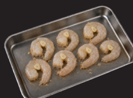
Garlic Shrimp w/o Shell