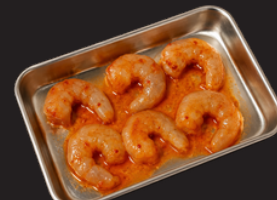
Spicy Shrimp w/o Shell