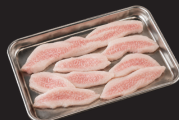
Pork Jowl Gluten-free