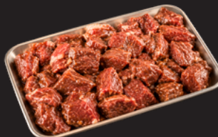
Marinated Beef Tenderloin