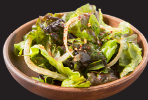
Korean Side Salad for One